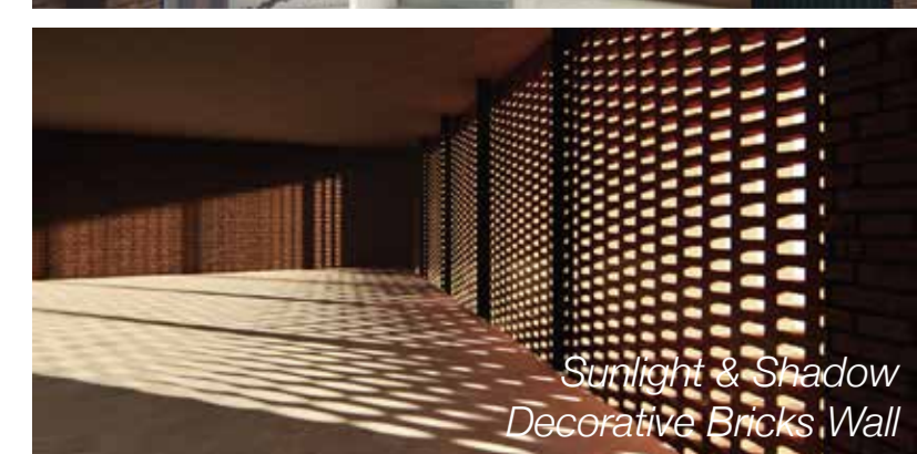
Light & Shadow Decorative Bricks Wall

The existing building was an old workshop of a concrete factory, built during 50s-60s in last century. It was a brick building with steel structure-roof and brick walls. There are no columns in the internal of the building but the structure is very stable, which is very friendly to renovate. The