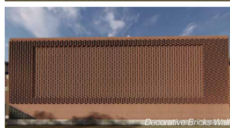
Decorative Bricks Wall