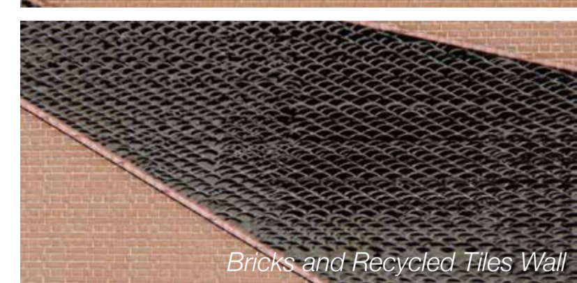
Bricks and Recycled Tiles Wall