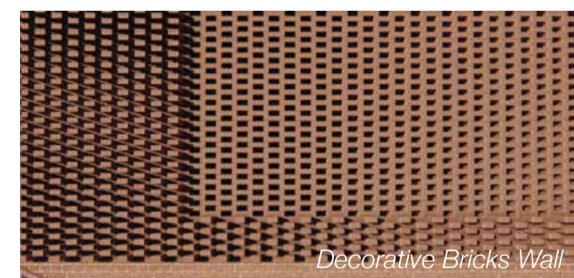
Decorative Bricks Wall