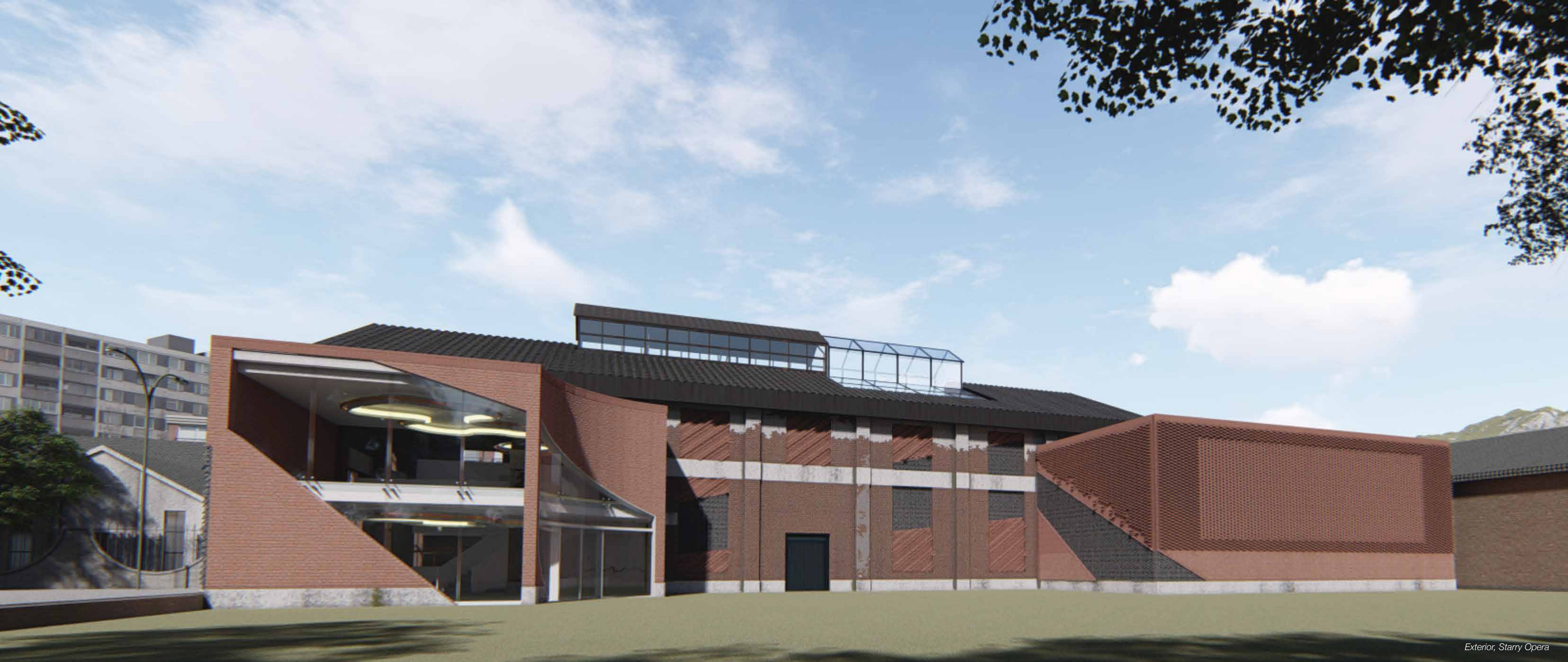
Exterior, Starry Opera